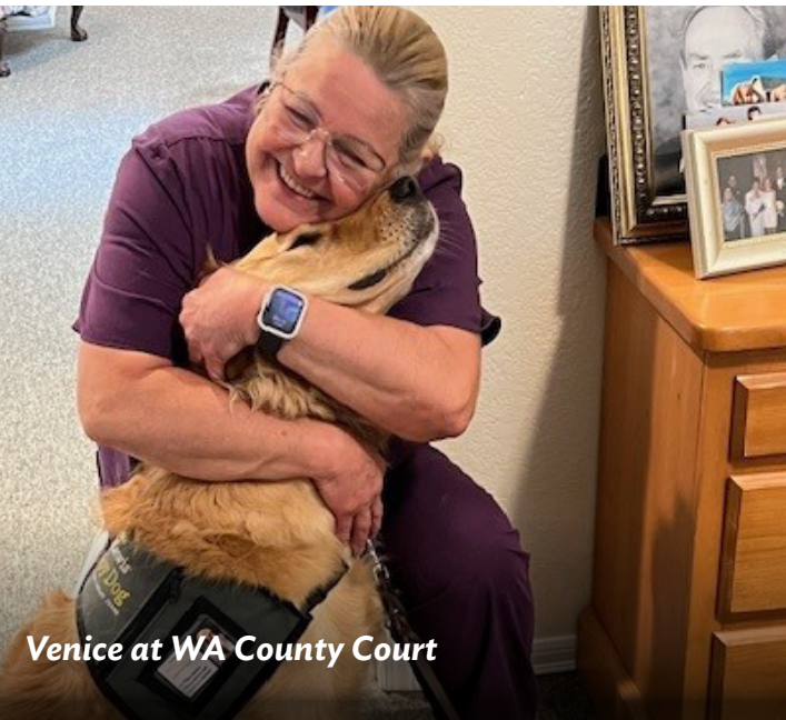
Venice at WA County Court