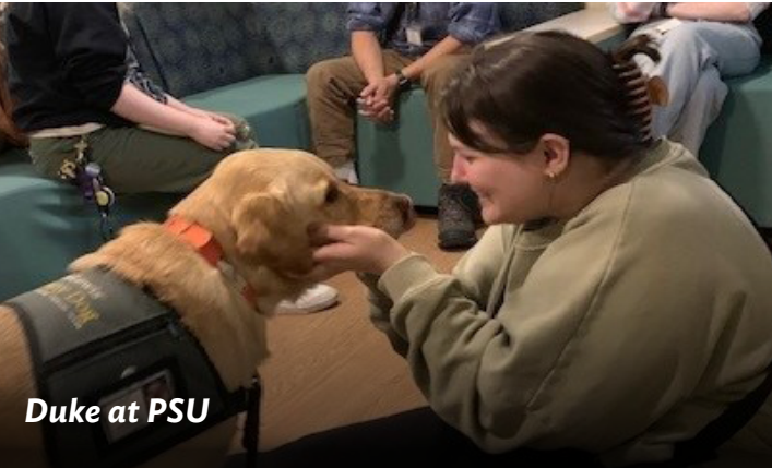
Duke at PSU