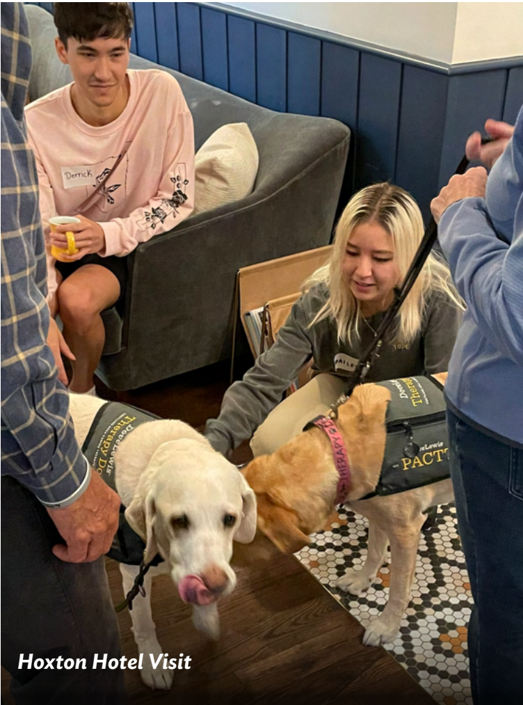
Hoxton Hotel Visit