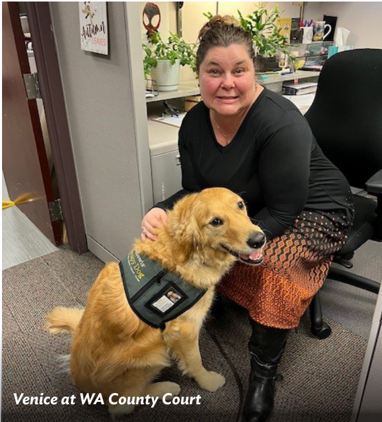
Venice at WA County Court