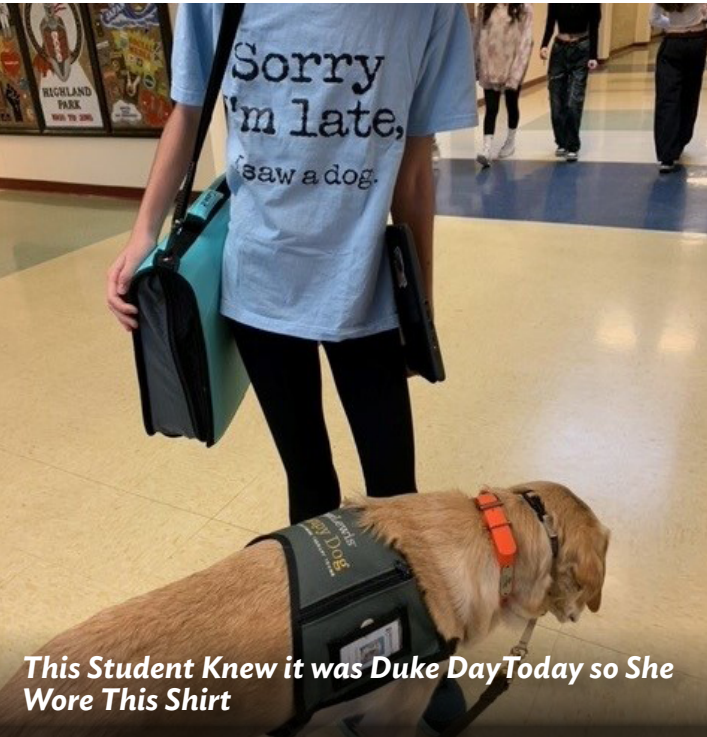
This Student Knew it was Duke Day Today so She Wore This Shirt