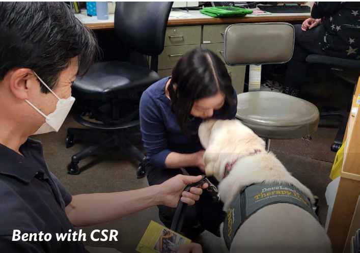
Bento with CSR