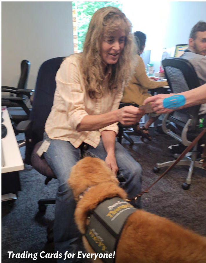
Trading Cards for Everyone!