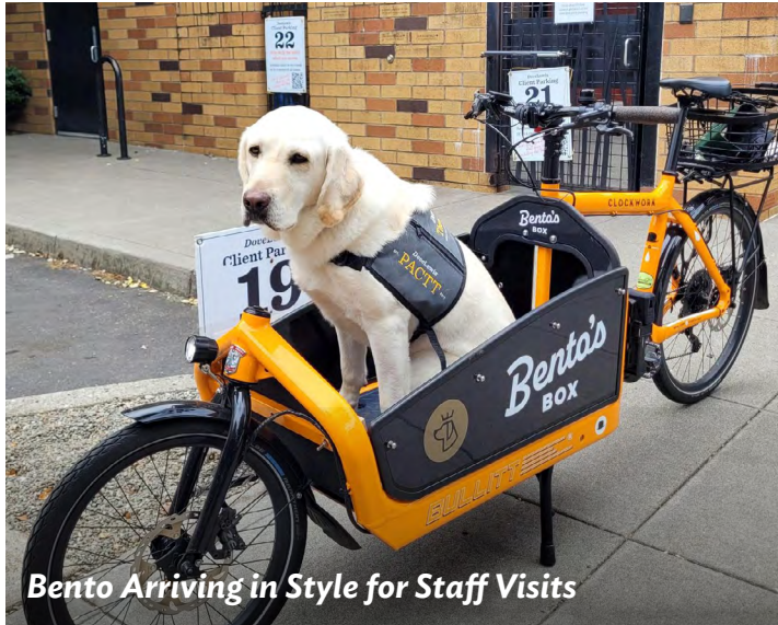
Bento Arriving in Style for Staff Visits