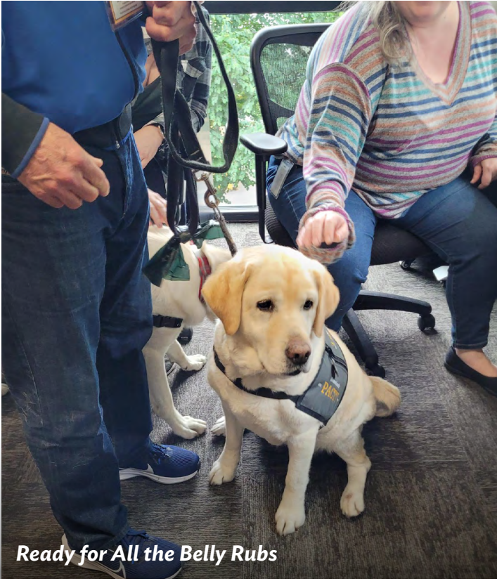
Ready for All the Belly Rubs