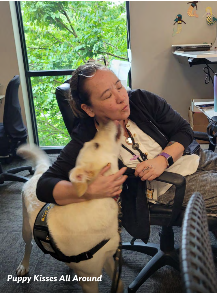
Puppy Kisses All Around