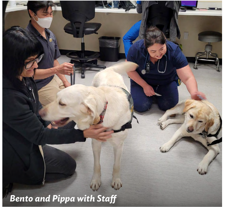
Bento and Pippa with Staff