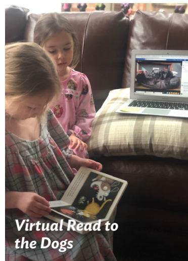
Virtual Read to the Dogs