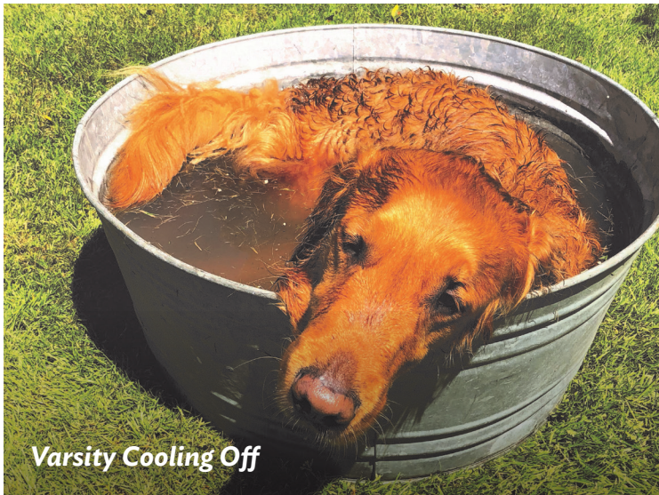
Varsity Cooling Off