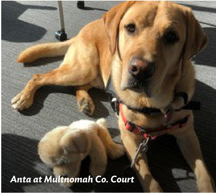
Anta at Multnomah Co. Court

TEAMS SUPPORTED ADULT AND CHILD VICTIMS and survivors in 9 cases which included sexual and domestic abuse and violence and human trafficking. These brave survivors are given a stuffed therapy dog to remind them of the strength and courage they had when they testified with a dog by their side. One young woman was able to spend time with one of our dogs before she went into court but was unable to take the dog with her. She told the victim advocate that she placed the stuffed dog on the stand in her view and look at it while she gave her testimony, helping her to focus and get through.