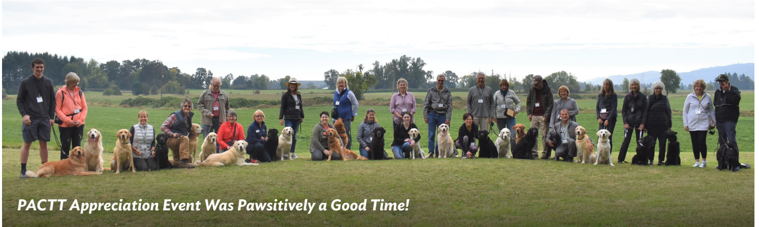
PACTT Appreciation Event Was Pawsitively a Good Time!