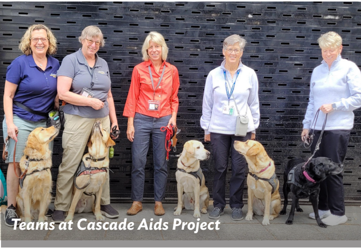
Teams at Cascade Aids Project