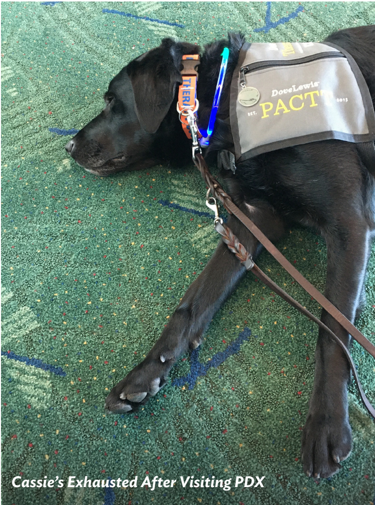
Cassie's Exhausted After Visiting PDX