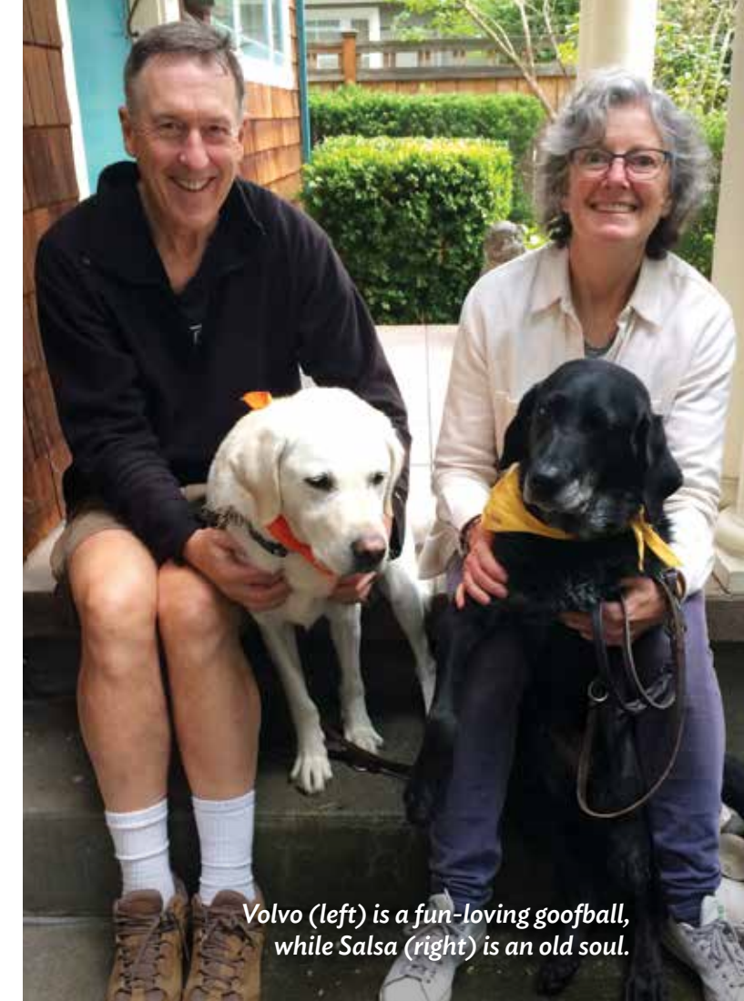
Volvo (left) is a fun-loving goofball, while Salsa (right) is an old soul.

Thank you, Salsa and Volvo, and our other generous volunteers in PACTT, the Blood Bank, stray animal transport and event/administrative support. Much of our work could not be accomplished without our 400+ volunteers who provide thousands of hours of service in support of animals and people.