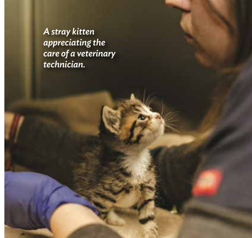
A stray kitten appreciating the care of a veterinary technician.

"Sometimes, you have to slow down and really concentrate to give these animals the best possible care."