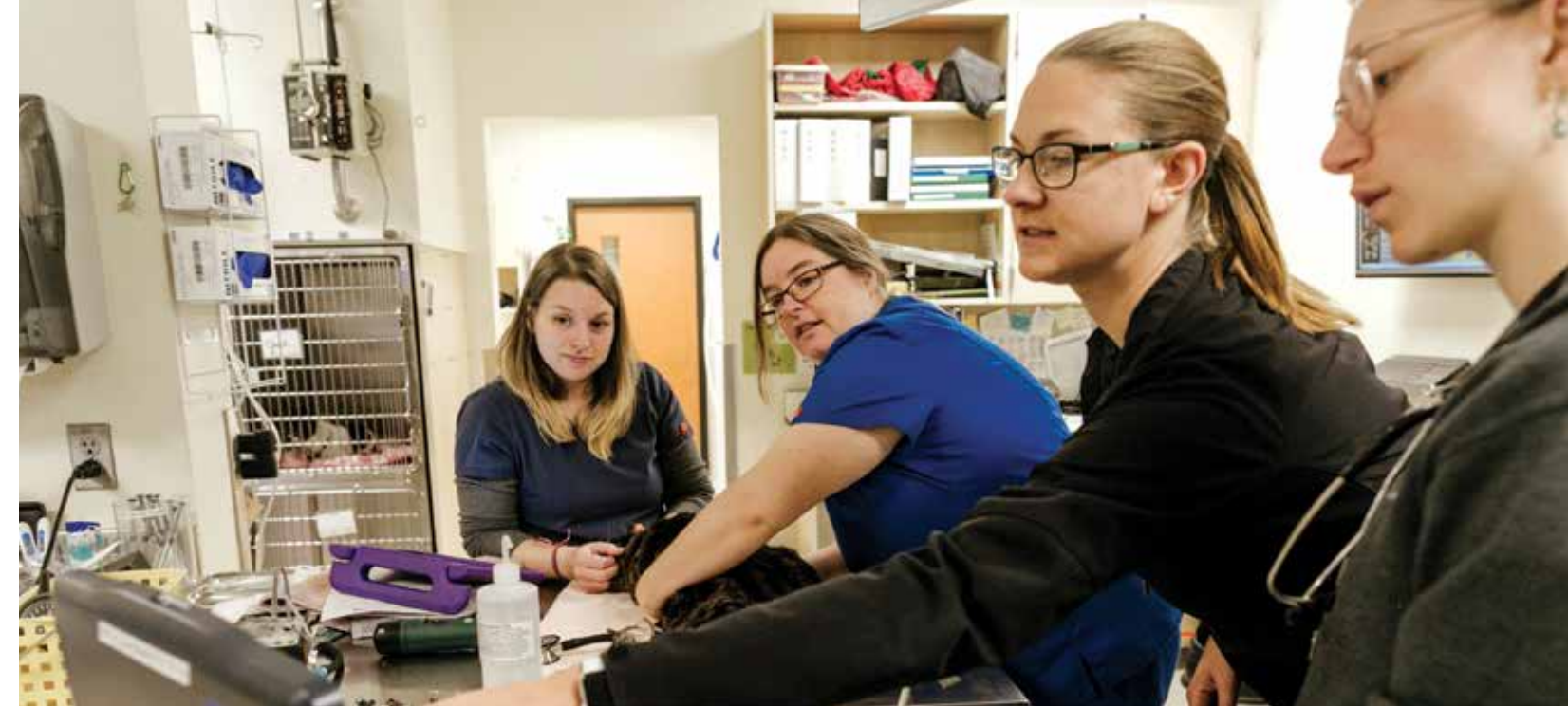
Two board-certified criticalists assist a staff veterinarian get a quality image of a patient's heart.