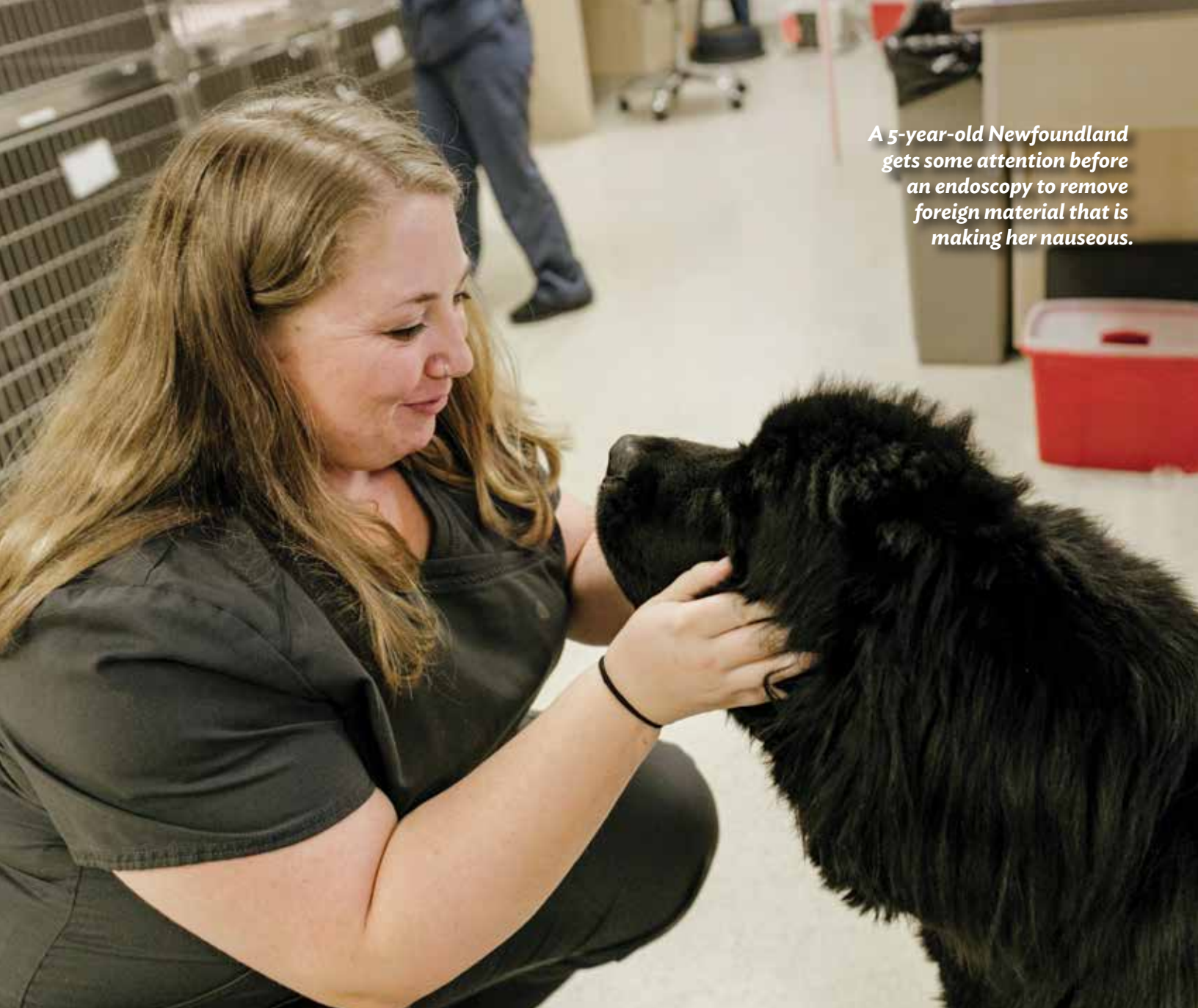
A 5-year-old Newfoundland gets some attention before an endoscopy to remove foreign material that is making her nauseous.